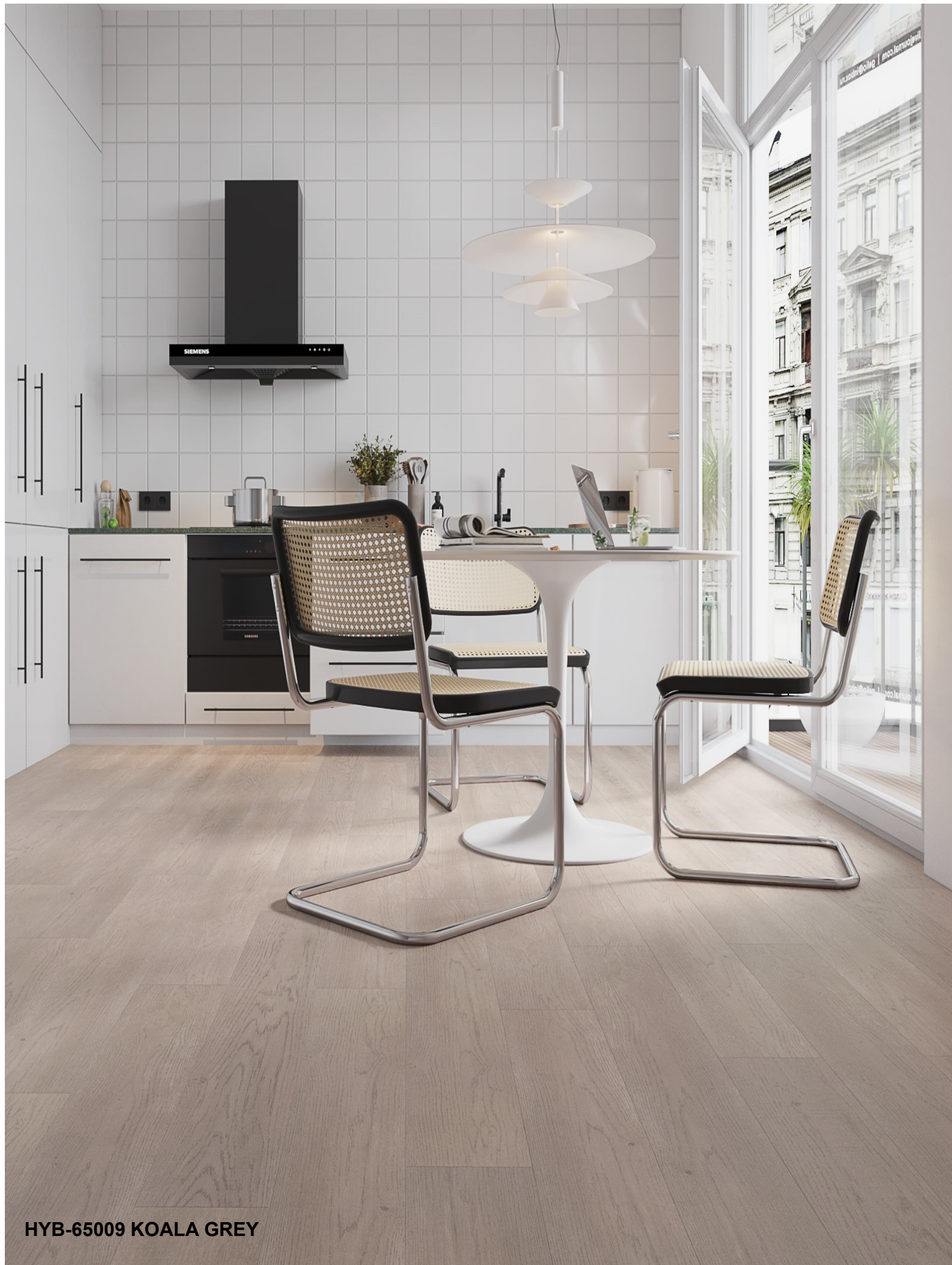
HYB-65009 KOALA GREY