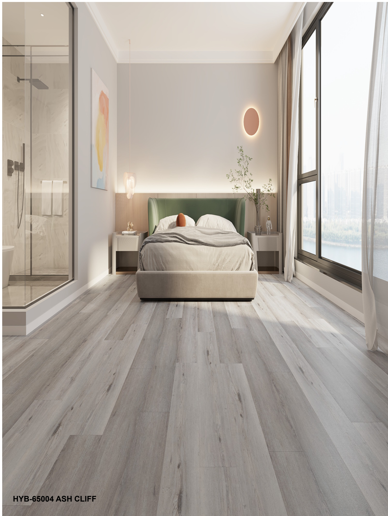
HYB-65004 ASH CLIFF