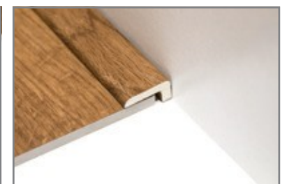
▲ L ANGLE