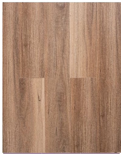
QLD Spotted Gum