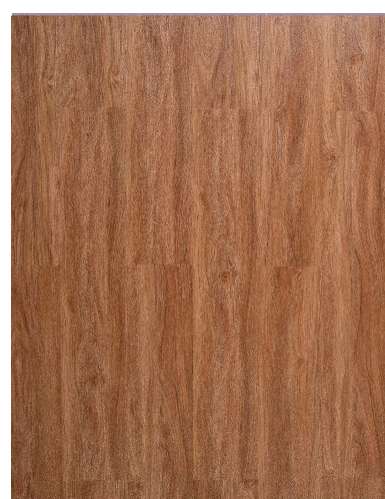
NSW Spotted Gum