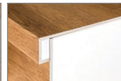
▲ STAIR NOSE