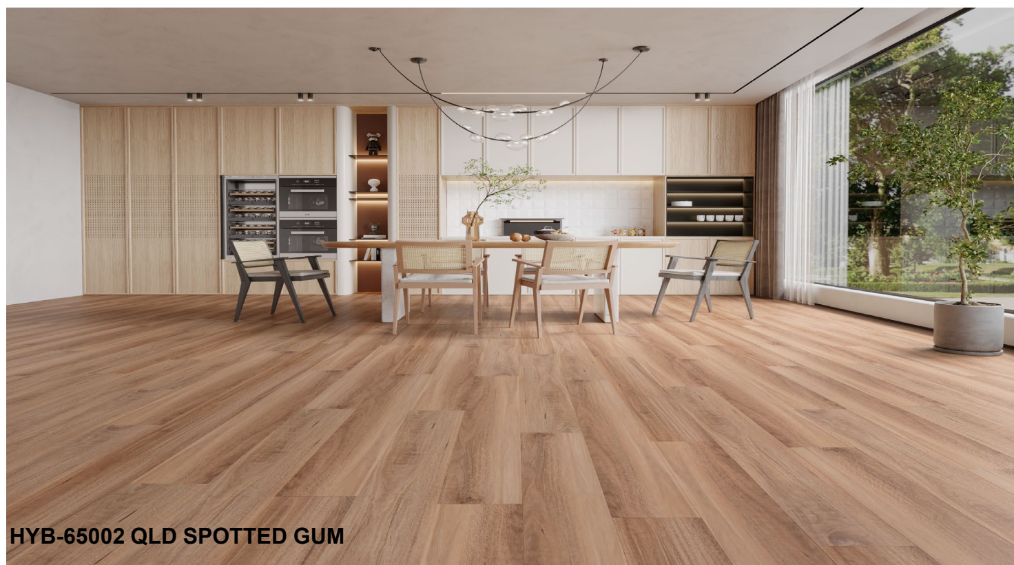
HYB-65002 QLD SPOTTED GUM