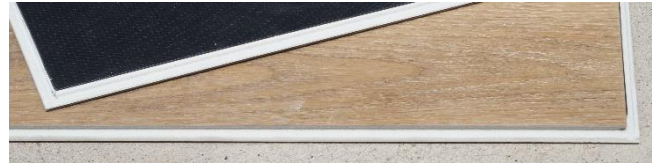
Close up of flooring, showing top/bottom and edge of flooring.