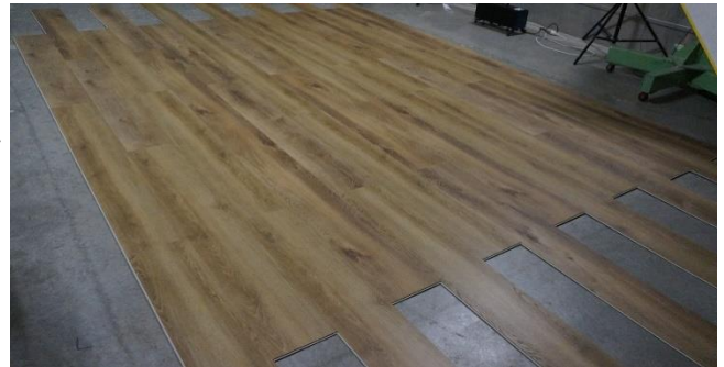
Test specimen installed in laboratory for test.