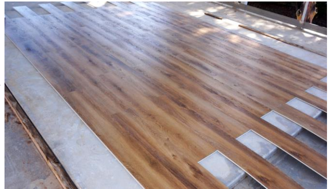
Test specimen installed in laboratory for test.