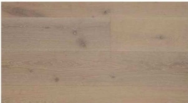
Dawn Frost 901605