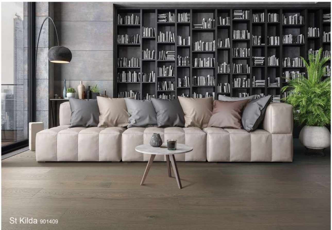
St Kilda 901409

Board Size: W x L x H 240mm x 2200mm x 14mm Finish: Satin Texture: Brushed Profile: Tongue & Groove Grade: ABCD