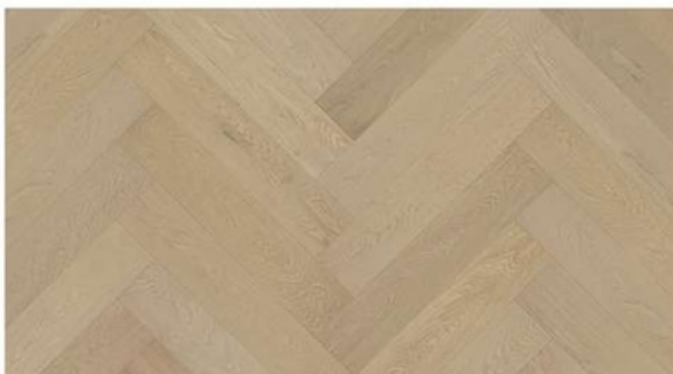
Leon Herringbone 901906