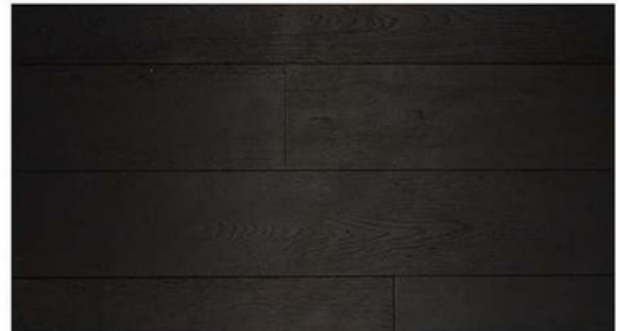
Night Sky 901604