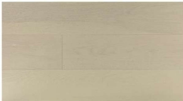
Fraser Island 901407