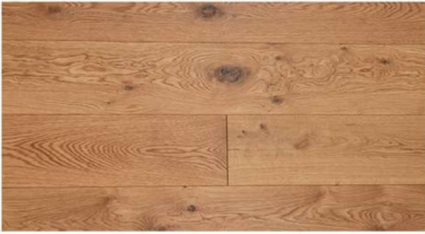
Pure Sun 901601