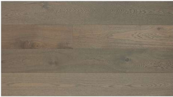
St Kilda 901409