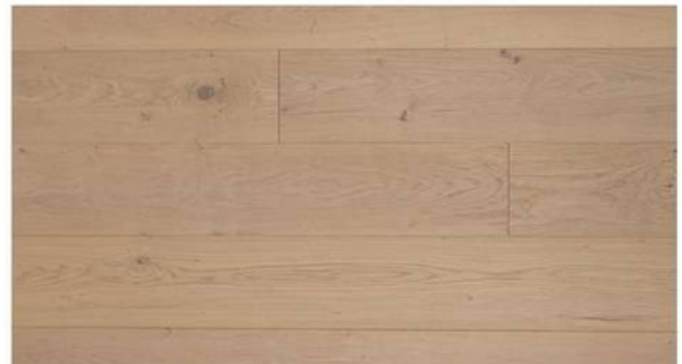
Tea Light 901606

Board Size: W x L x H 220mm x 2200mm x 20mm