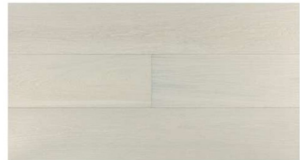
White Heaven 901406