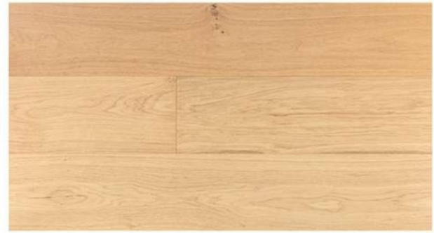
Gold Coast 901402