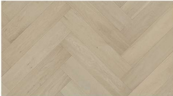
Valencia Herringbone 901902