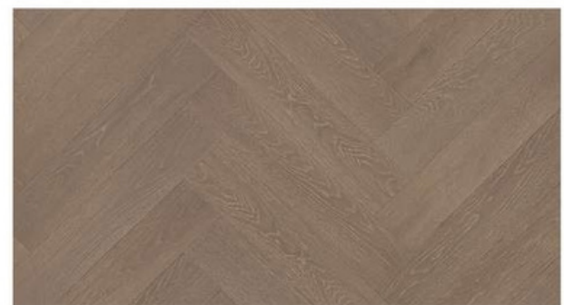
Murcia Herringbone 901909