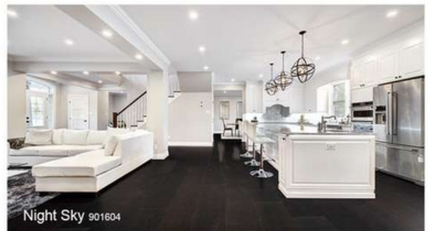
Night Sky 901604

Create glamorous spaces and rooms in your apartment, home, beach villa, retail outlet or office with the real look and feel of Oak timber.