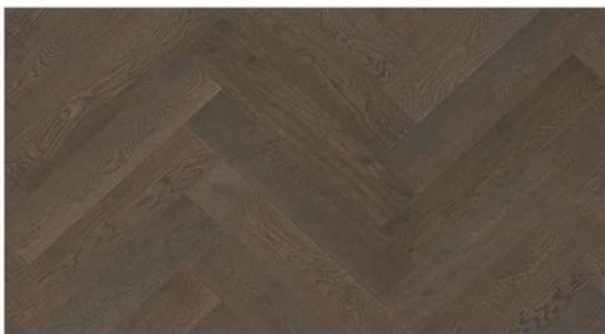
Toledo Herringbone 901910