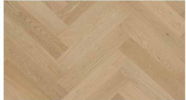
Cartegena Herringbone 901905